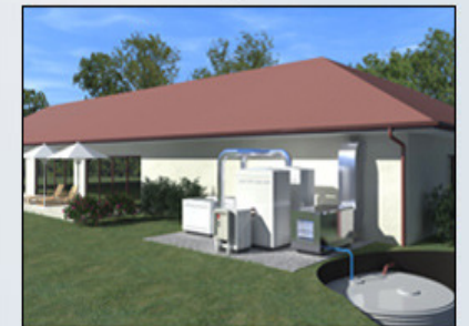
Water, Standby Power and Air