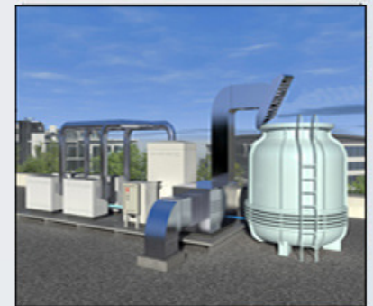
Water Recovery, Power and Air