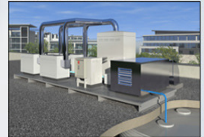
Water, Power and Air

“MultiGen's fully automated process is simple to install, monitored remotely and carries a 5 year warranty and service contract”