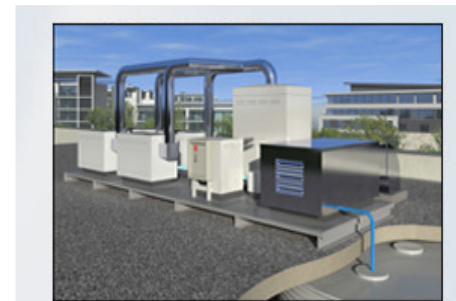
Water, Power and Air

Gas turbines generate exhaust heat to power the absorption chillers that work with the water maker that collects moisture from the air or evaporation from an a cooling tower. Electricity made by the turbine is used by the building, feed back to the grid or for backup power. The system can also produce heated water, chilled water, cool and hot air for air conditioning