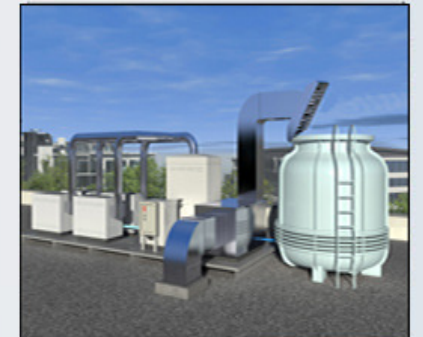
Water Recovery, Power and Air